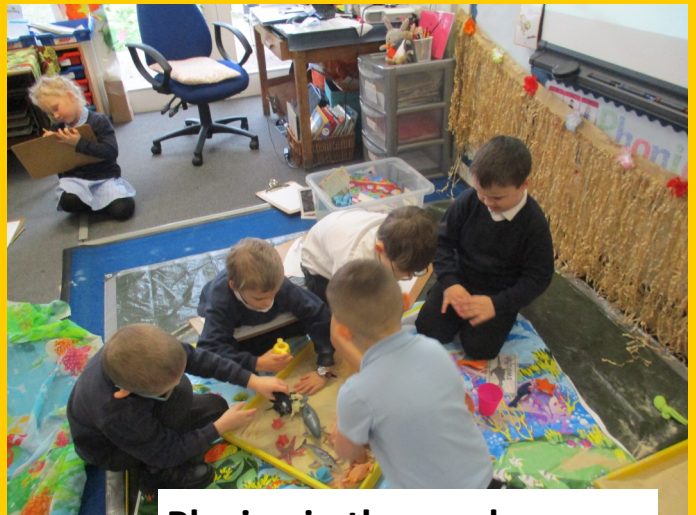
Playing in the sand

This week children in Y123 took a trip to Tobago! They flew by aeroplane and had a great time experiencing some of the foods, activities and sights there. This was to prepare them for their new topic using the book 'Gregory Cool'.