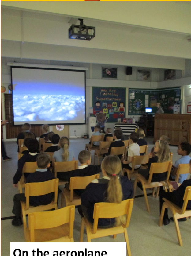
On the aeroplane

This week children in Y123 took a trip to Tobago! They flew by aeroplane and had a great time experiencing some of the foods, activities and sights there. This was to prepare them for their new topic using the book 'Gregory Cool'.