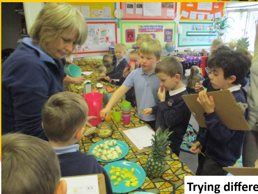
Trying different fruits