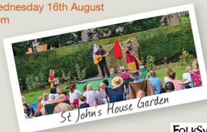
St John's House Garden