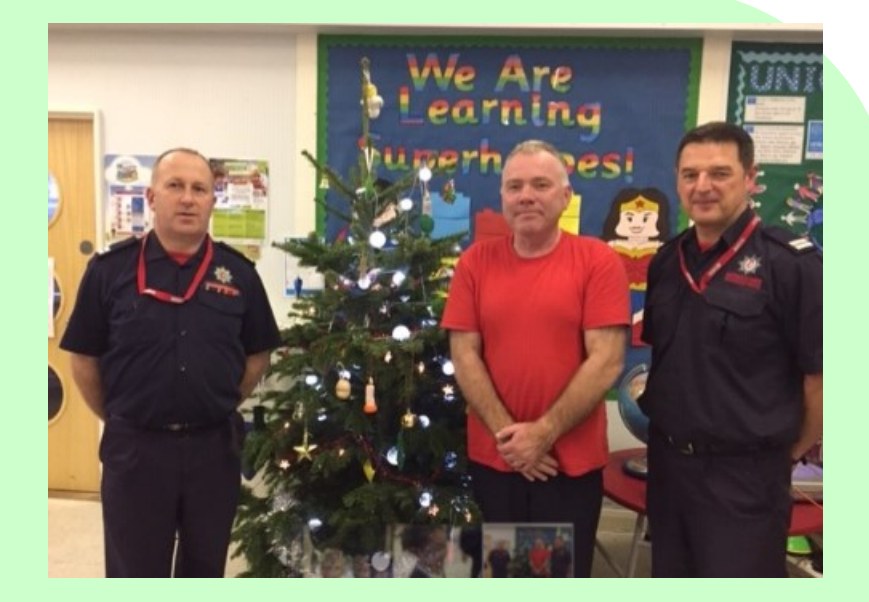
We were joined by the fabulous firefighters from Gaydon Fire Station.