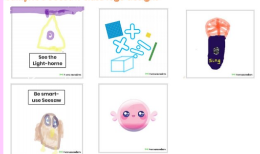
Valkyrie's SeeSaw class logo designs

We will be starting to use more videos of us teachers on Seesaw and email to share learning with the children as we believe it will be good for the children to see familiar faces, and we can so some direct teaching more effectively by personal posts of this nature. Your children can respond on the Seesaw journal or by email with questions/ follow up.