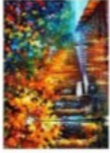
A Impressionist painting

Impressionism began in 1860 and was popular in the 19th and 20th centuries. Impressionism was a movement in art that was interested in capturing the light and color of the world around them. They were not interested in painting the world as it was, but as it appeared to them. They were interested in the way that light and color changed throughout the day. They were interested in the way that the world appeared to them at different times of the day. They were interested in the way that the world appeared to them at different times of the day. They were interested in the way that the world appeared to them at different times of the day.